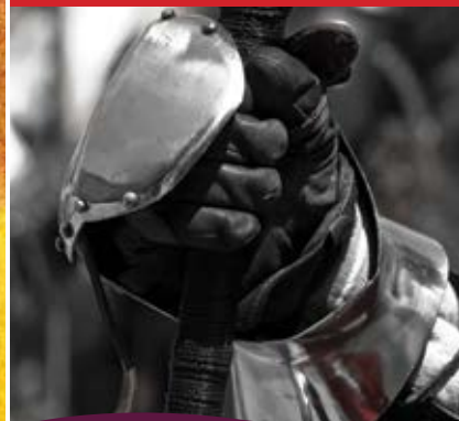
Distinctives: The Practice of Protest