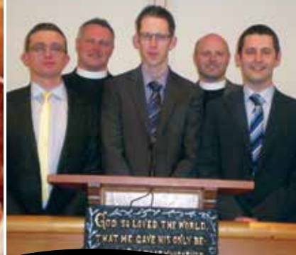
New Elders Installed