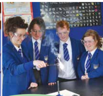
Spotlight on the Schools