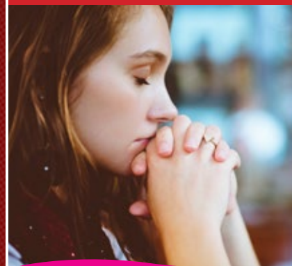
A Word to Women