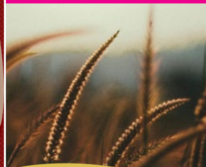
Mission Board: Another Year is Dawning