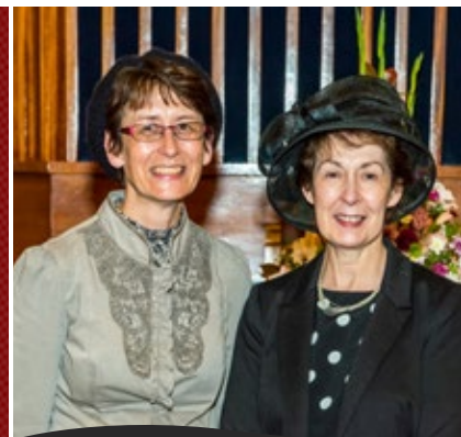
Welcome to Enniskillen