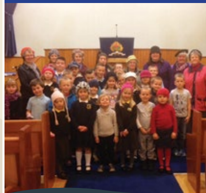
Congregation Call: Moneyslane