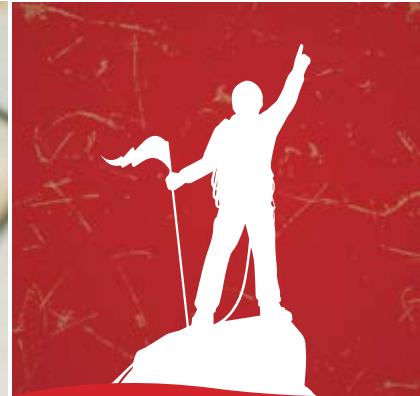
The Power of the Cross