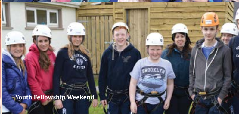
Youth Fellowship Weekend