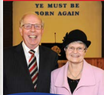
Fifty Years Following Christ