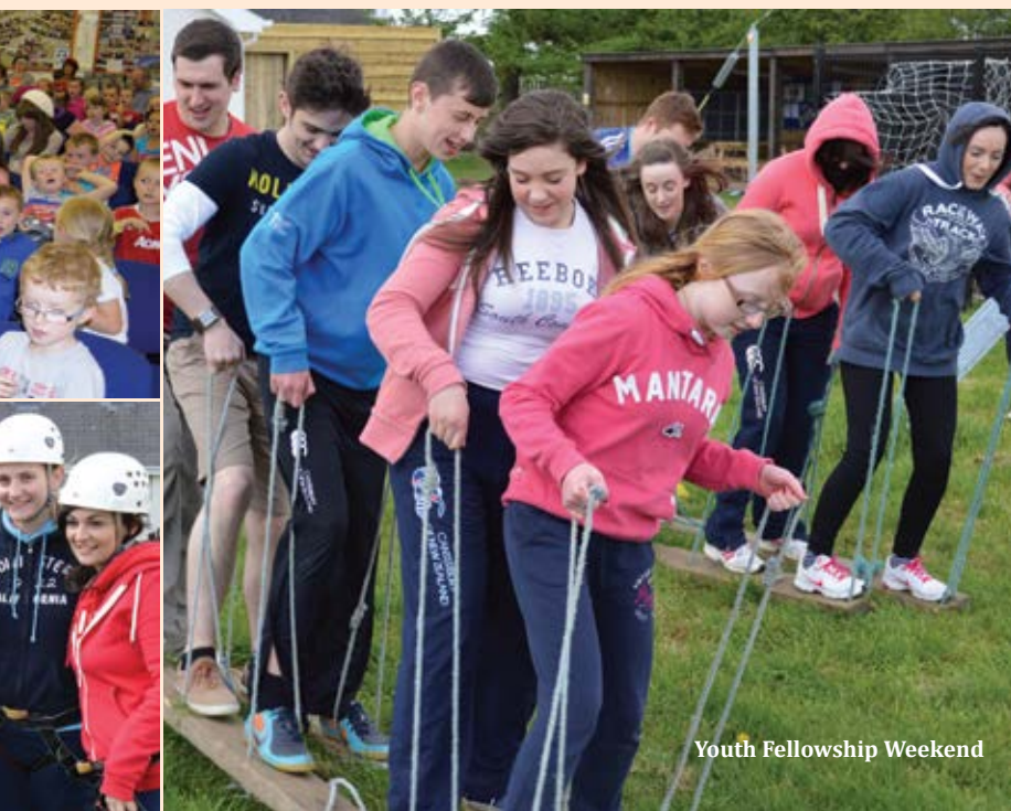
Youth Fellowship Weekend