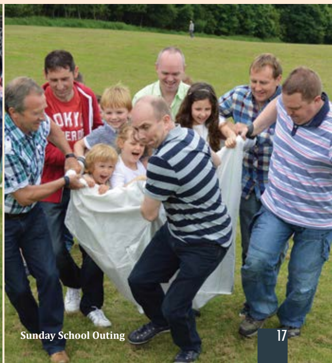
Sunday School Outing