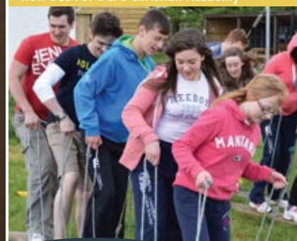
Congregation Call: Hebron