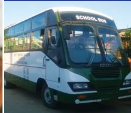
New Bus For BCFC Christian Academy