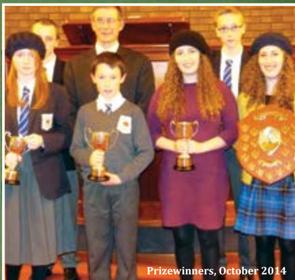
Prizewinners, October 2014