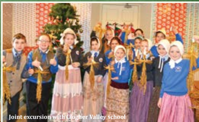
Joint excursion with Clogher Valley school