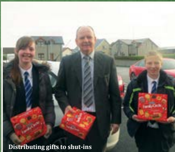
Distributing gifts to shut-ins