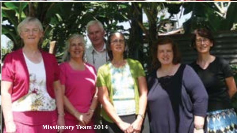
Missionary Team 2014

I t is almost 20 years since I left Ulster to serve in Kenya. Many changes have taken place in my adopted country – more vehicles on the roads, motorbike taxis everywhere, supermarket chains opening in many “up country” towns, university satellite campuses all over the country – the list goes on and on!