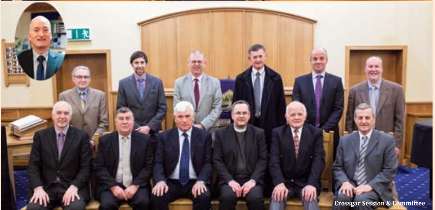
Crossgar Session & Committee