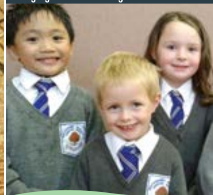
Spotlight on the Schools