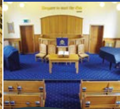
Congregation Call: Crossgar