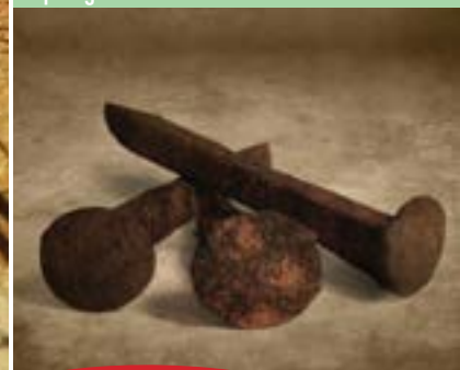
Willing to do the Father's Will