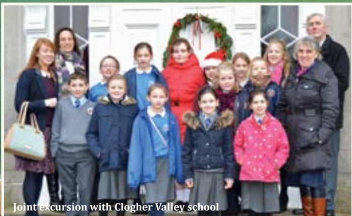
Joint excursion with Clogher Valley school