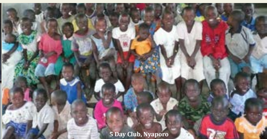
5 Day Club, Nyaporo